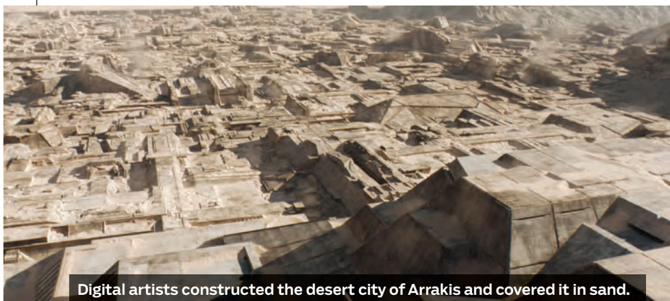
Digital artists constructed the desert city of Arrakis and covered it in sand.

ed on a motion base that was blasted by the SFX team with different types of sand, which the VFX team emulated and added scope to all the interior shots of the huge sandstorm itself, Connor notes.