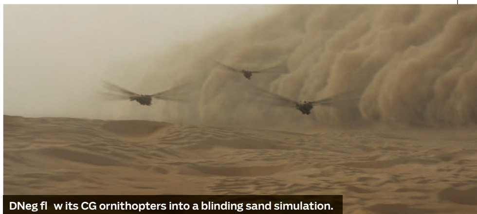
DNeg flew its CG ornithopters into a blinding sand simulation.

Meanwhile, House Atreides forms an alliance with the Fremen. Soon, however, the Harkonnens wage war on House Atreides — just as the emperor had hoped would happen, thus weakening the powerful Atreides.