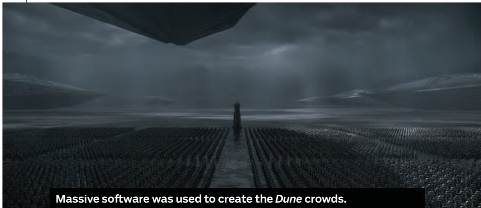
Massive software was used to create the Dune crowds.