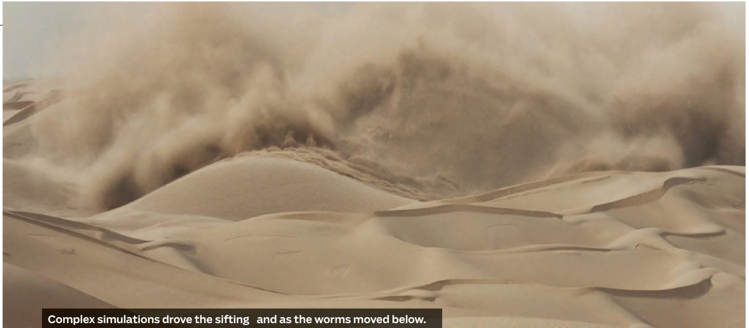
Complex simulations drove the sifting and as the worms moved below.