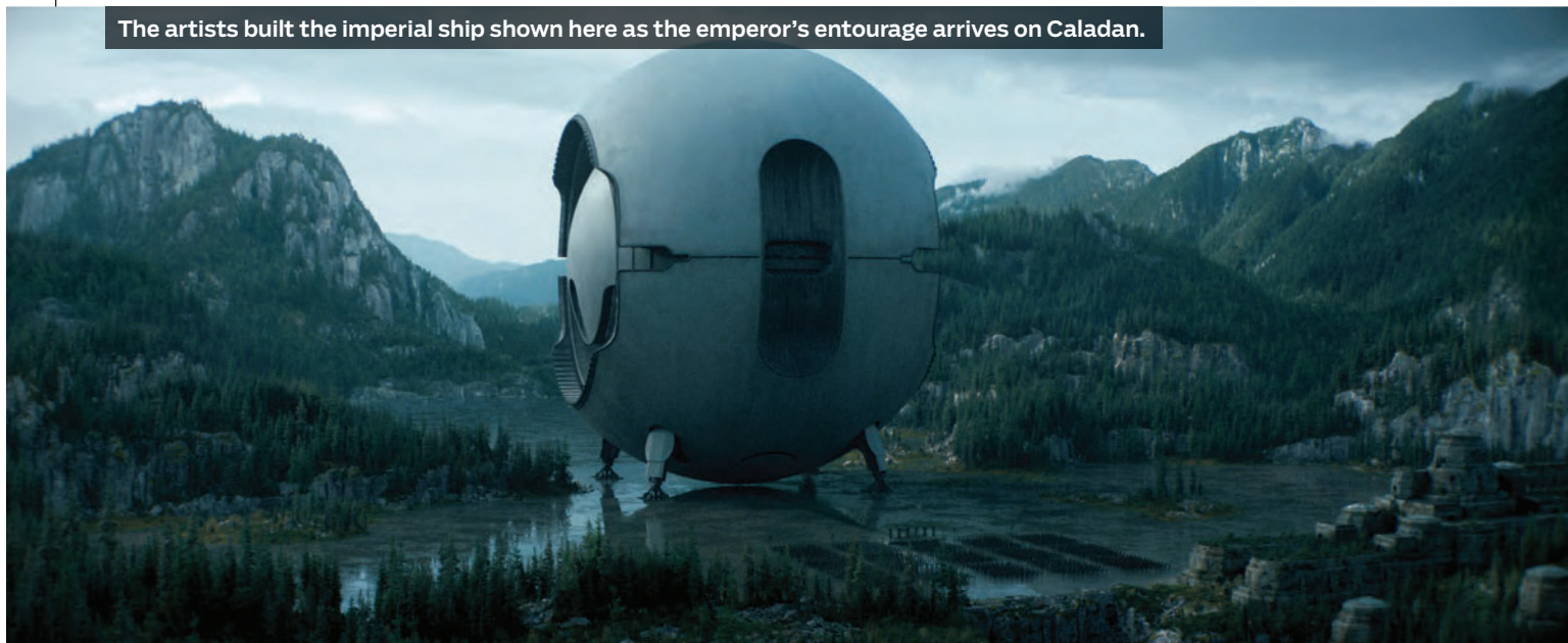
The artists built the imperial ship shown here as the emperor's entourage arrives on Caladan.

In fact, there were instances when the filmmakers retained the raw sand screen in the shots, as it blended in so well. For example, the exterior sand screens also allowed visors and any diffuse reflections on the various troops and ornithopters also to be kept