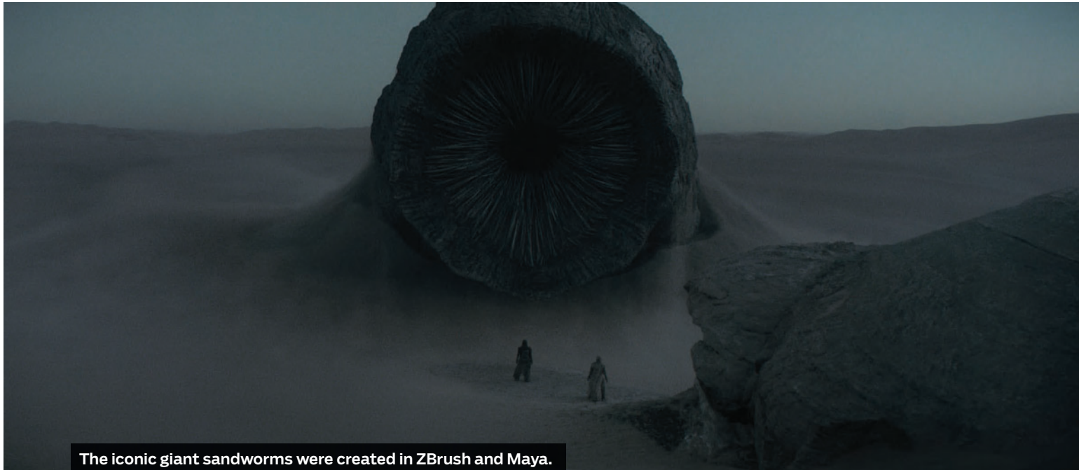
The iconic giant sandworms were created in ZBrush and Maya.

slant upward, opposite to the direction the wind is coming from, thus enabling the wind to blow over the tops of the buildings — “an architectural functionality in the city that’s designed to withstand the sandstorms that inevitably sweep over the city from time to time,” he explains.