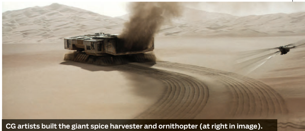
CG artists built the giant spice harvester and ornithopter (at right in image).

After arriving there, they face great danger from the giant sandworms that produce the spice, which is mixed in with the sand, and find themselves in the midst of unrest, as the local inhabitants, known as the Fremen, are distrusting of the new custodians after long fighting for their freedom and homeland against the planet's previous guardians, the cruel Harkonnens, who were expelled by the emperor and replaced by House Atreides.